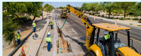
Beardsley WRF Solids Pipeline Rehabilitation, City of Peoria