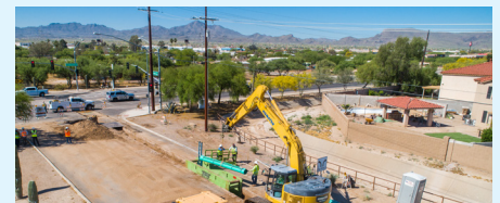
Twin Peaks-Blue Bonnet Gravity Sewer, Pima County