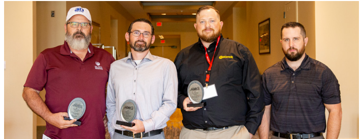
The Val Vista Transmission Main Rehabilitation CMAR project won the Project of the Year Award: Environment, $5M, But Less Than $25M.