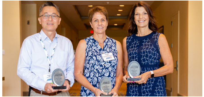
The Downtown Chandler Canal Restoration won the Project of the Year Award: Historical Restoration/Preservation, Less Than $5M.